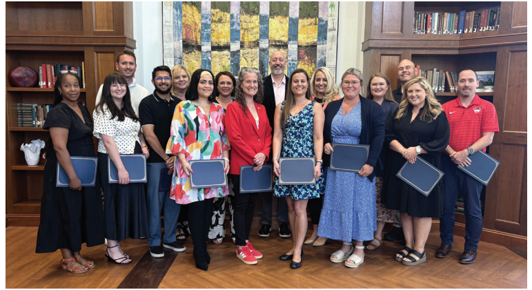
The AIKCU Advancing Leaders Class of 2026 posed for a photo on the last day of the program, held at Transylvania University.

Learn more about the AIKCU Advancing Leaders Program at www.aikcu.org/advancing-leaders-program .