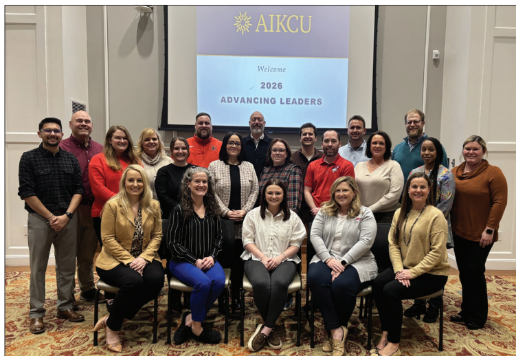
AIKCU welcomed the Advancing Leaders Class of 2026 to the program at Transylvania University in February.

See who's in the Class of 2026 at www.aikcu.org/advancing-leaders-class-of-2026 .